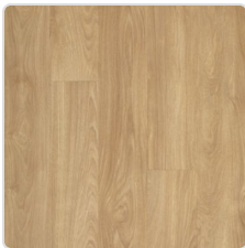
Amtico Wood 450