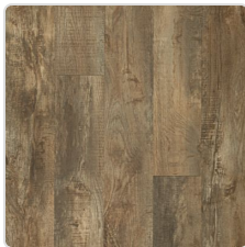
Autumn Gold Wood 87