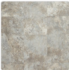
Quartz Stone 94