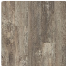
Prairie Wood 960