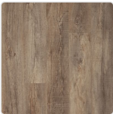
Barnwood Wood 280