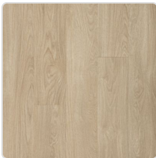
Biloba Wood 220