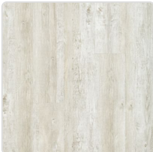
Dove Tail Wood 92