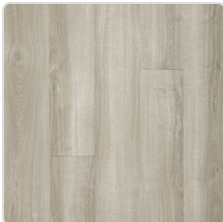
Silver Fox Wood 91