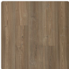
Charleston Wood 840