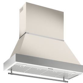
K48HERTX + KC48HERTAV Ivory gloss canopy