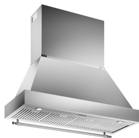
K48HERTX + KC48HERTX Stainless steel canopy