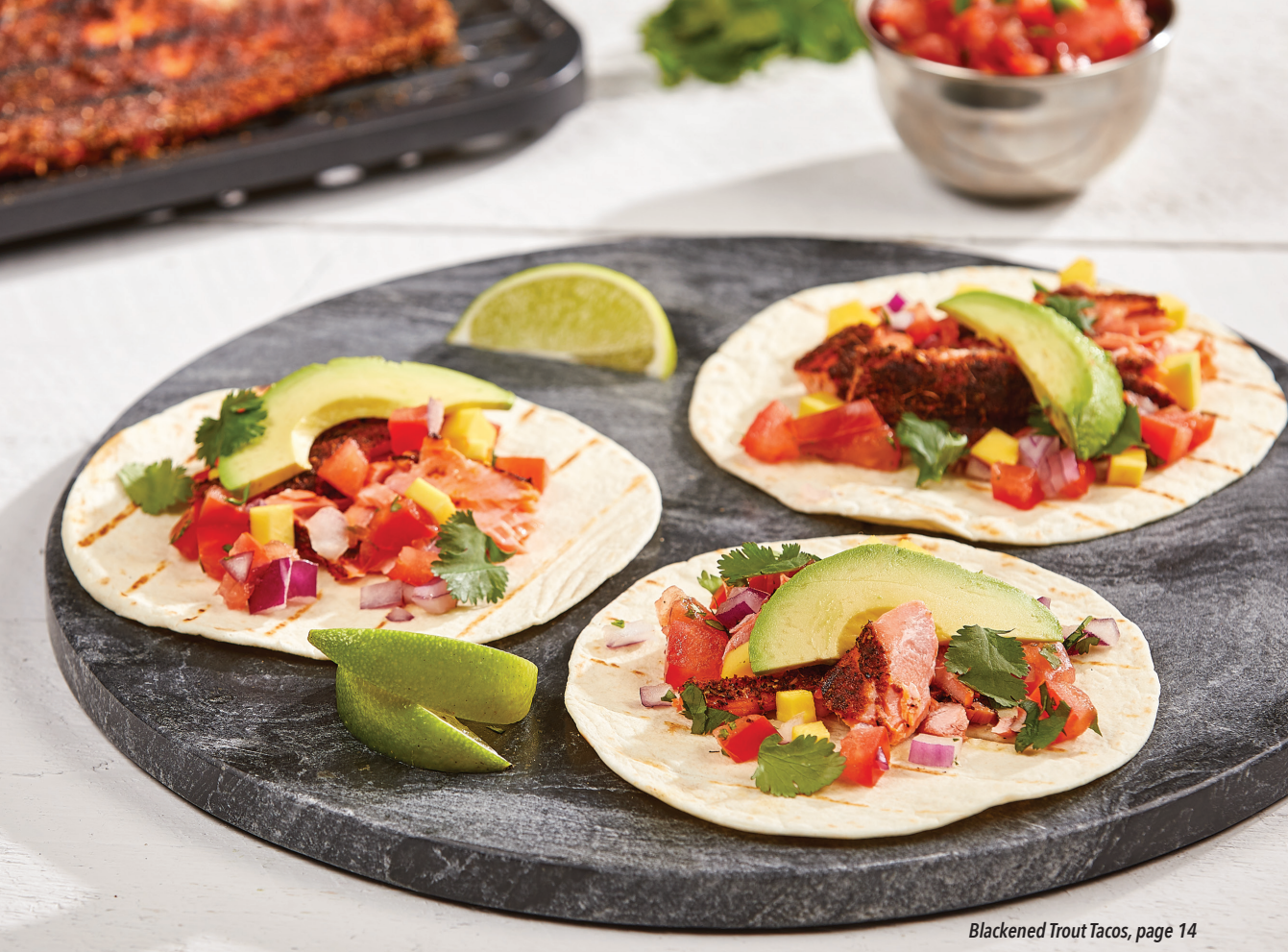
Blackened Trout Tacos, page 14

PowerXL ™ products that excel SMOKELESS GRILL