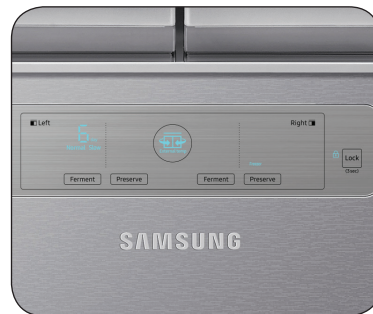
Super Precise Cooling