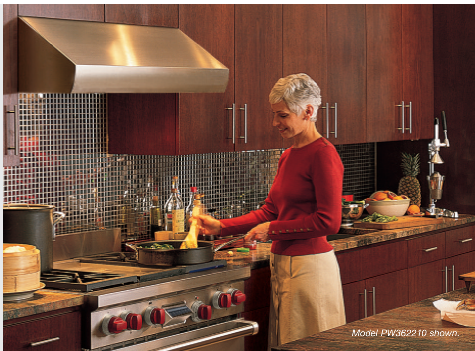
Model PW362210 shown.

With standard features like heat sentry and dual setting halogen lighting, Wolf pro wall hoods provide the ultimate in ventilation. Pro low-profile wall ventilation hoods are available in four widths.