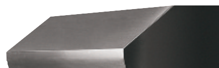
Model PW362210 Pro Wall Hood

Accessories are available through your authorized Wolf dealer. For local dealer information, visit the find a showroom section of our website, wolfappliance.com .