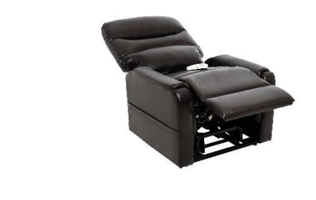
FDA Class II Medical Device*