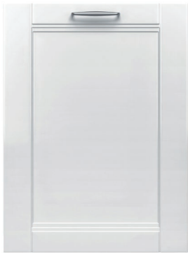
SHV78DM3N Custom Panel

Patented CrystalDry™ technology transforms moisture into heat to get dishes, including plastics, 60% drier.*