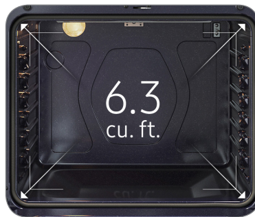
Large Oven Capacity

Fingerprint Resistant Black Stainless Steel