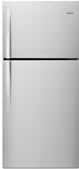
Monochromatic Stainless Steel WRT519SZDM