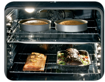
Flex Duo™ Oven