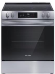
GCWS3067AF Wall Oven