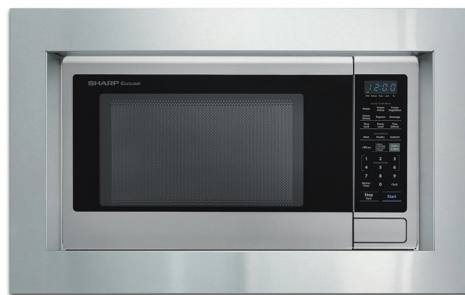
RK56S27F and RK56S30F