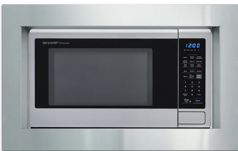
RK49S27F and RK49S30F