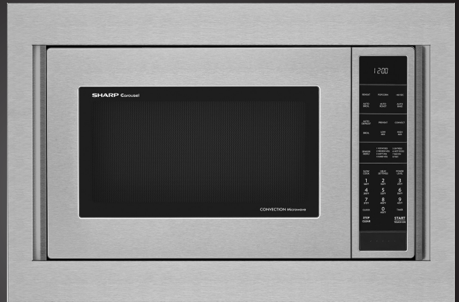
SMC1585BS Convection Microwave Oven with the RK94S30F Trim Kit

Includes Ducting, Finish Trim, and Easy-to-Follow Instructions