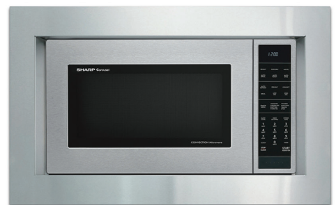
RK94S27F and RK94S30F