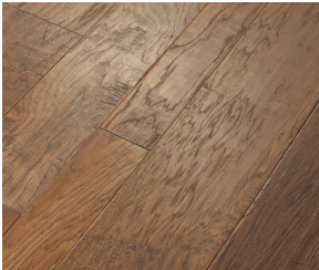
2000 Pacific Crest