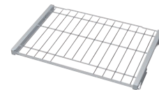
HEZTR301 30" Telescopic Rack

For help and assistance with Bosch accessories please visit: www.bosch-eshop.com/eshop/bosch/us or call 1-800-944-2904 Mon-Fri 5am to 6pm PST Sat 6am to 3pm PST