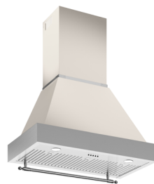
K36HERTX + KC36HERTAV Ivory gloss canopy