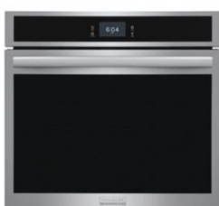
GCWS3067AF Wall Oven