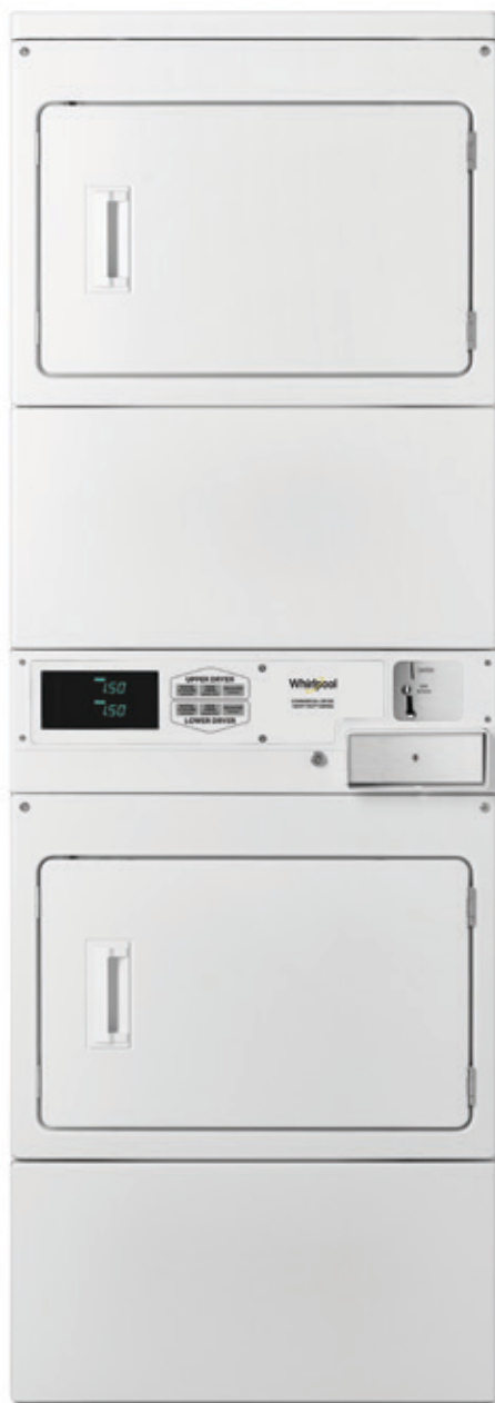
CSP2940HQ / CSP2941HQ

Why Buy: Get the capacity of two dryers in the space of only one.