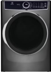
ELFE7637AT 600 Series Electric Dryer