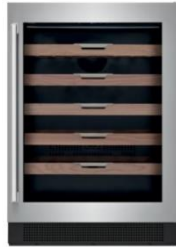
EI24WC15VS Wine Cooler