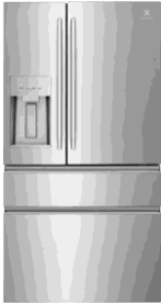
ERM2295AS French Door Refrigerator