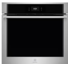
ECWS3012AS Wall Oven